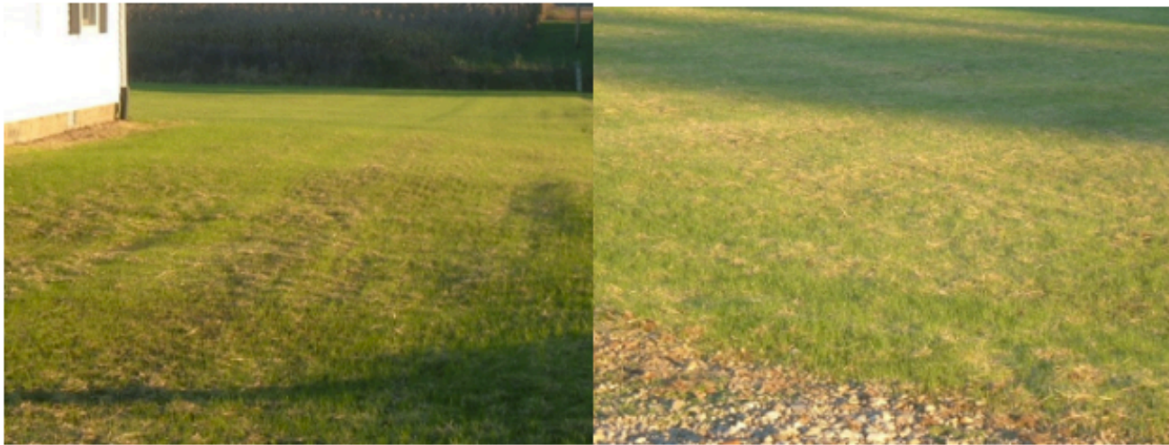
Twenty-two days after seeding: